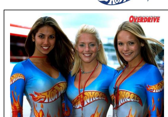
I'm a big fan of Hot Wheels - Ed.